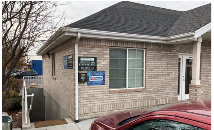
UNITS 1-7 ON THE SOUTH EAST PORTION OF BUILDING B