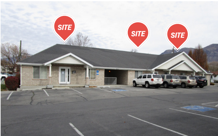
BUILDING A -