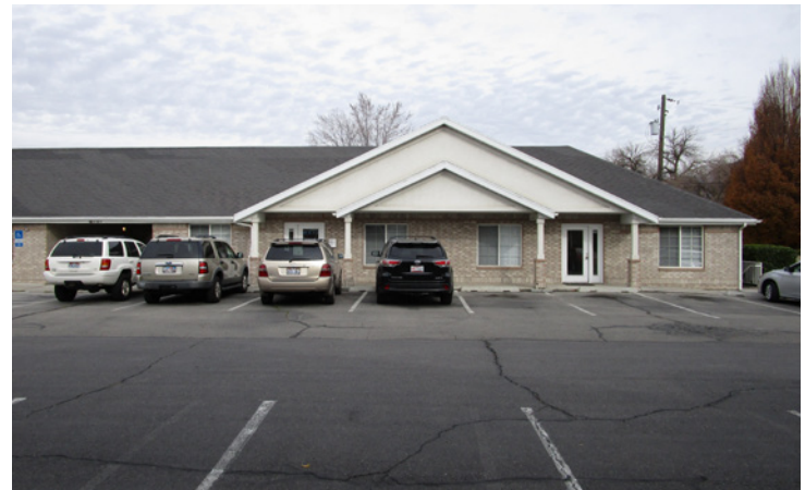
BUILDING A - EAST UNITS