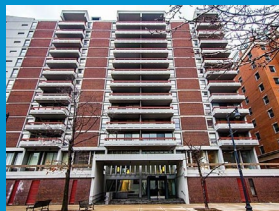
566 Commonwealth Ave

KRISTIN BLOUNT 617 330 8105 kristin.blount@colliers.com