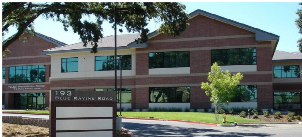
CLOCKWISE FROM TOP: Building Lobby // Reception // Exterior // Lobby // Kitchen