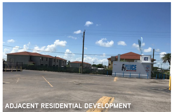
ADJACENT RESIDENTIAL DEVELOPMENT