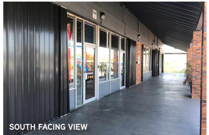
SOUTH FACING VIEW