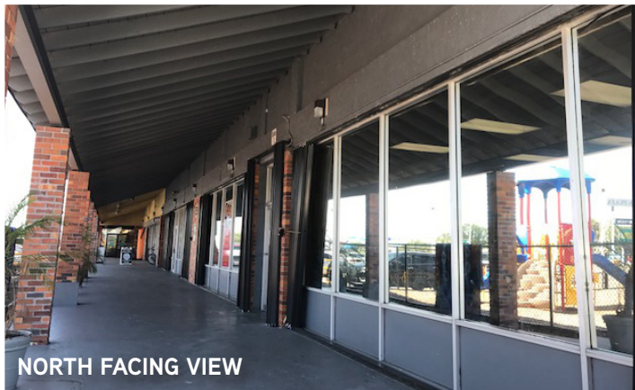
NORTH FACING VIEW