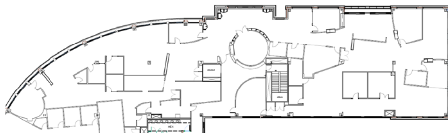
1 FLOOR PLAN SCALE: 1/8" = 1'-0"