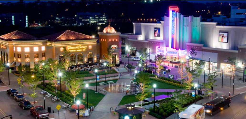
View From Vacant Suite