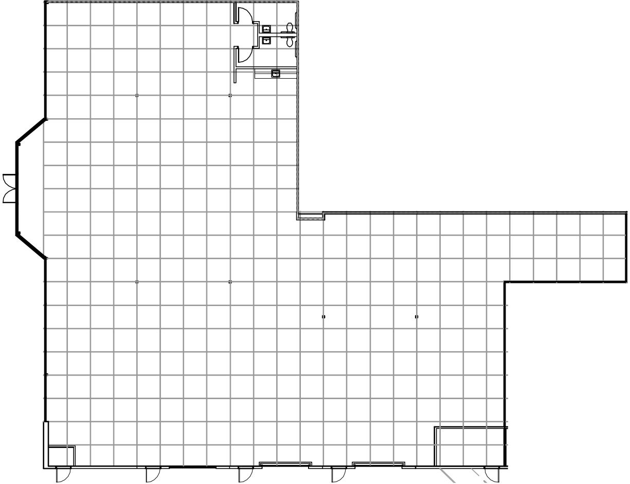
Suite 9535 8,420 SF

9515-9595 SW Gemini Drive | Beaverton, OR