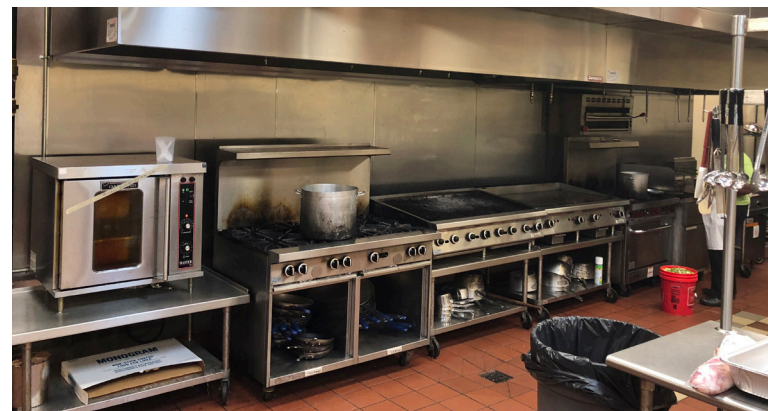
CLOCKWISE FROM TOP: Dining & Gathering Room // Warehouse // Commercial Kitchen // Parking Lot