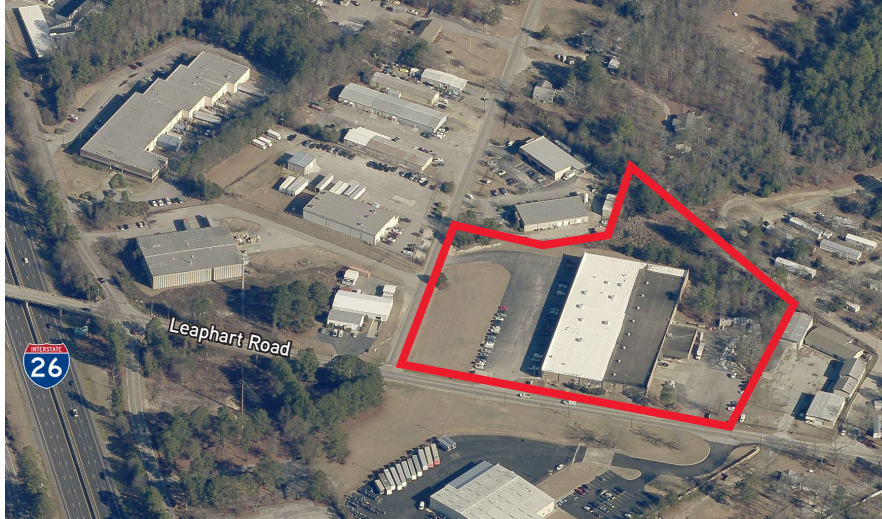
2500 Leaphart Road West Columbia, SC, 29169