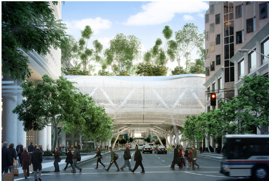
Transbay Terminal rendering, First and Mission

Located on the main thoroughfare between the Financial District and future Transbay Terminal—scheduled to be completed in 2018.