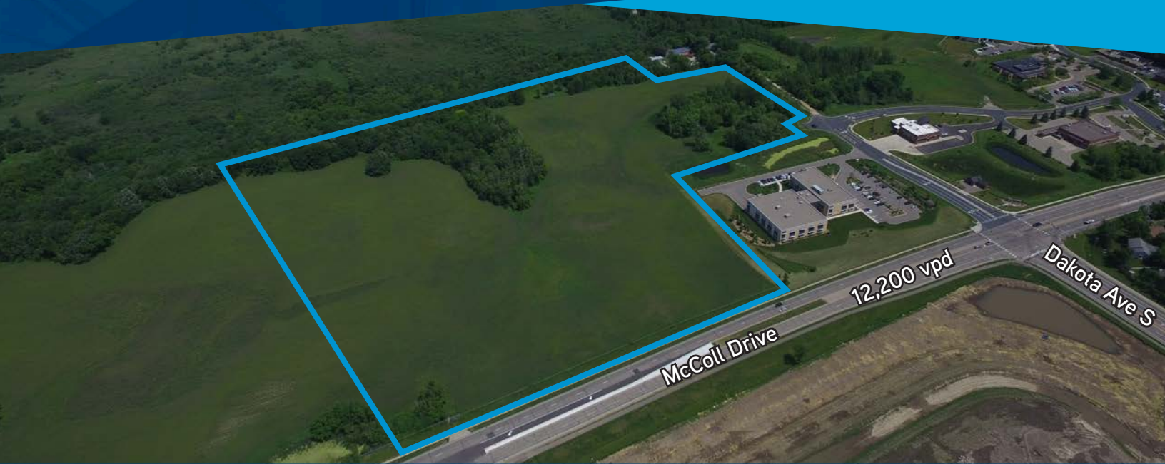
SITE 1: 29.06 ACRES (DIVISIBLE TO 2 ACRES)