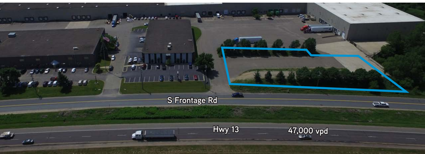
SITE 2: 1.02 ACRES (LEASE ONLY)