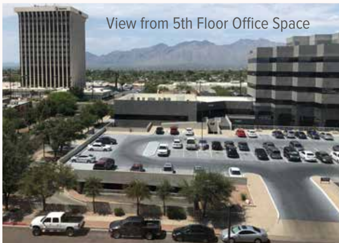
View from 5th Floor Office Space