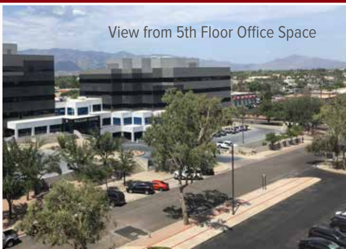
View from 5th Floor Office Space