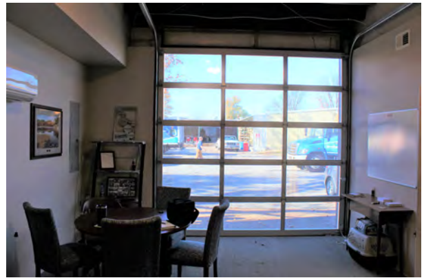
Corner Office includes operational garage door with two-way glass panels