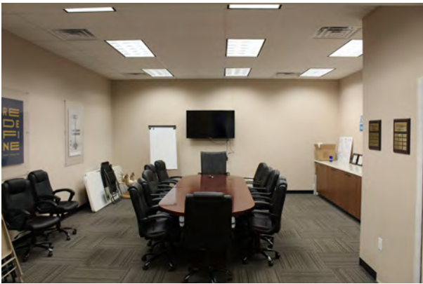
Enormous Conference Room