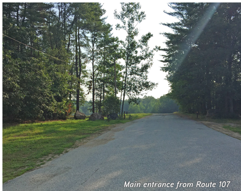
Main entrance from Route 107