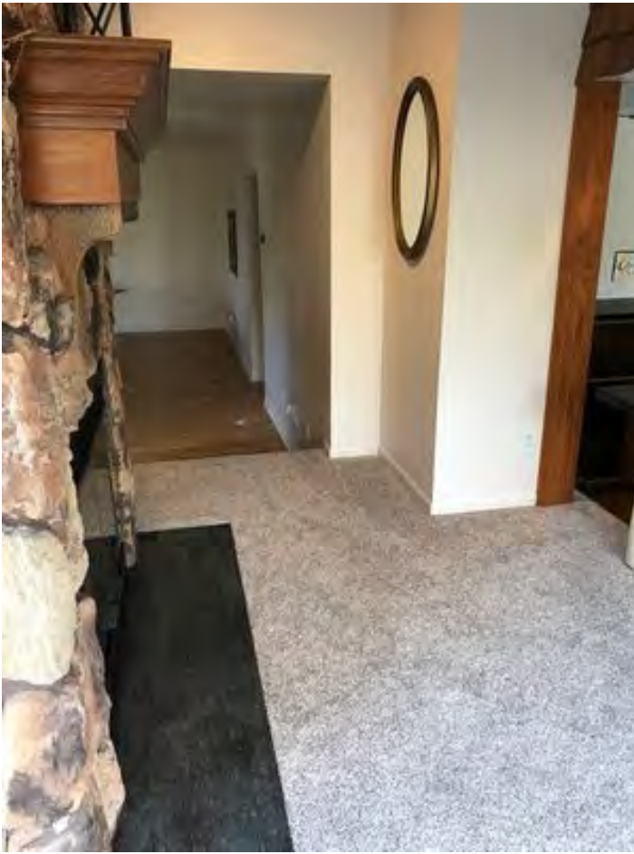
Apt 207 #8 (15)