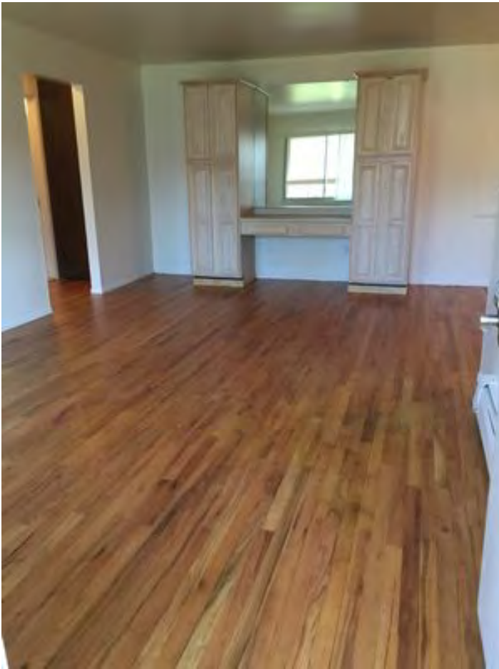
Apt 203 #7 (3)