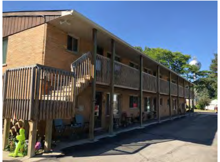
203 S Harris - exterior apartments 1