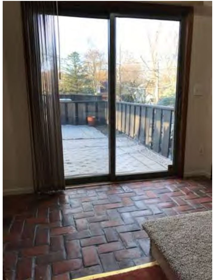
Apt 207 #8 (18)