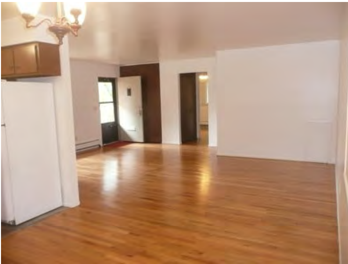
Apt 203 #10 (3)