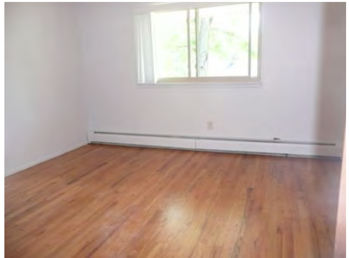
Apt 203 #6 (1)