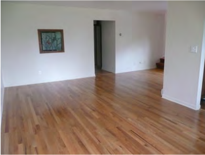
Apt 207 #8 (7)