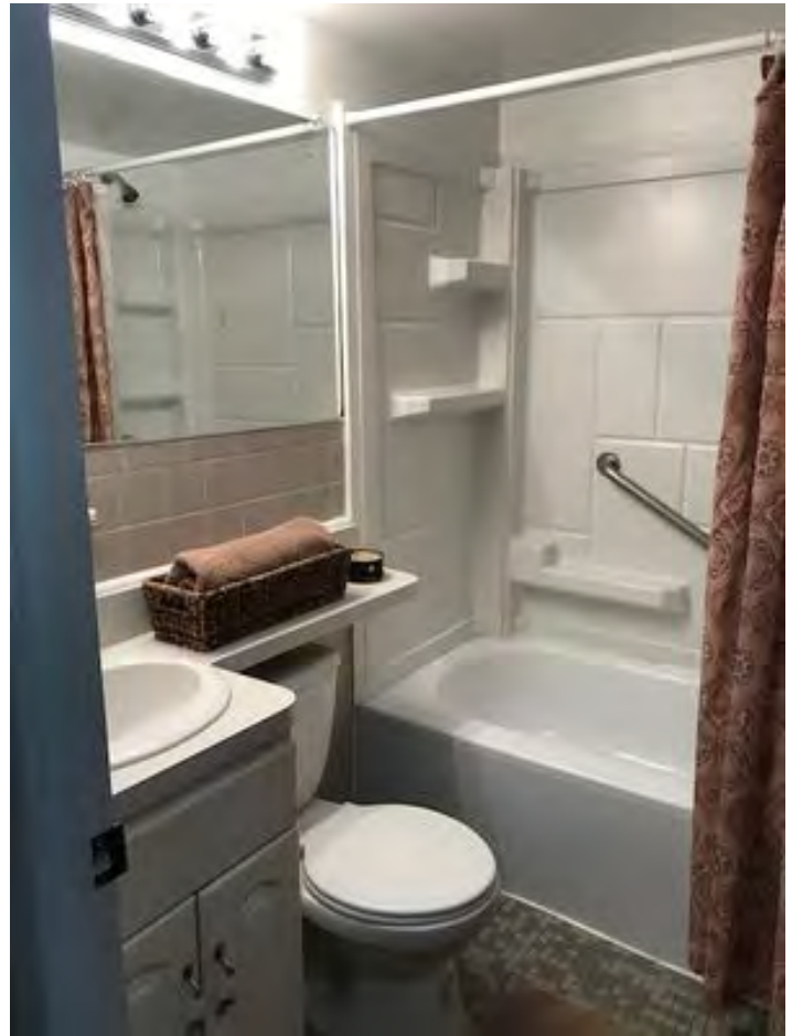
Apt 203 #4 (11)