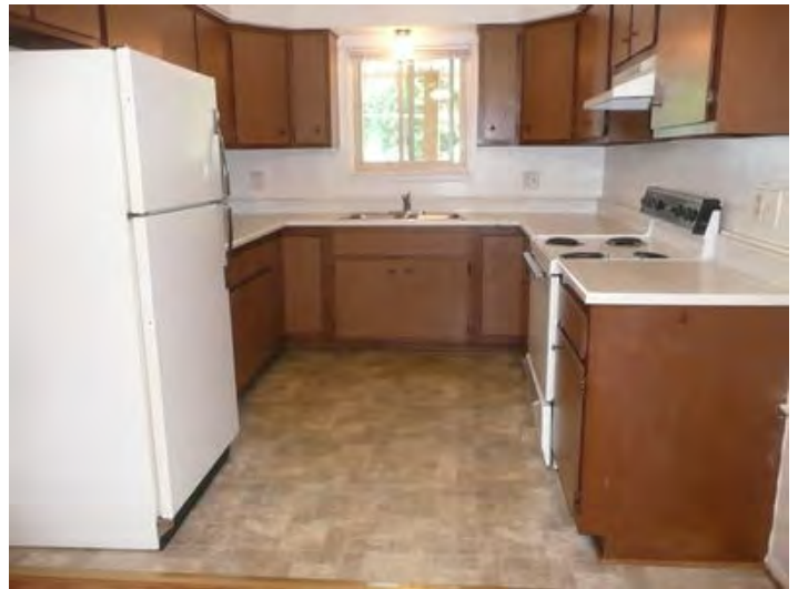
Apt 203 #8 (1)