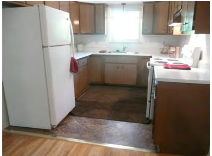
Apt 207 #7 (7)