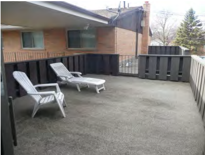
Apt 207 #8 (2)