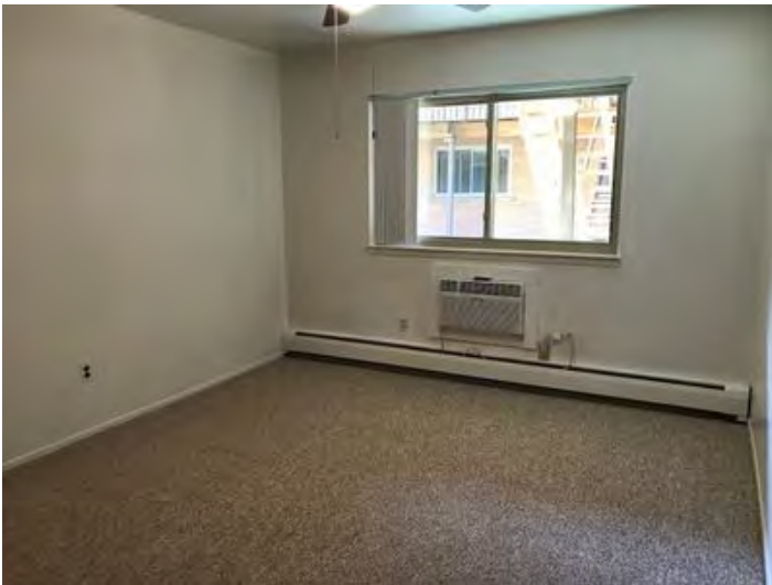
Apt 207 #3 - interior 3