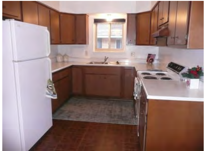
Apt 203 #9 (1)