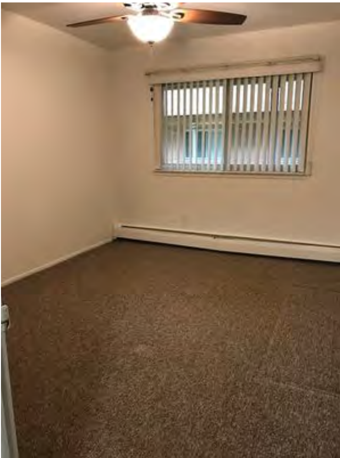
Apt 203 #4 (10)