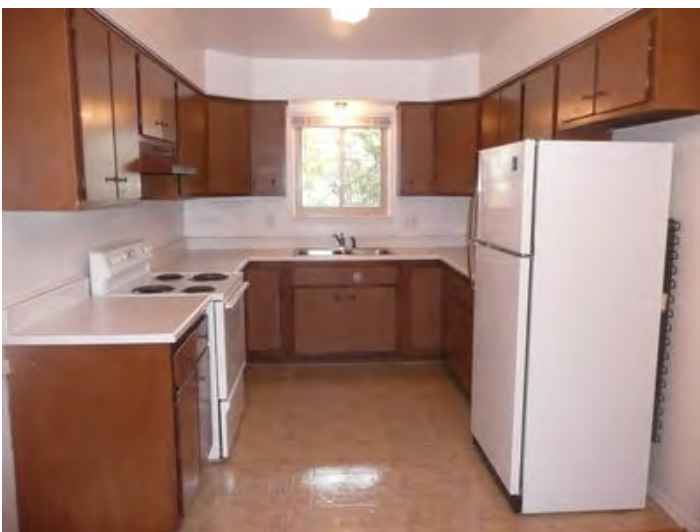
Apt 207 #6 (3)