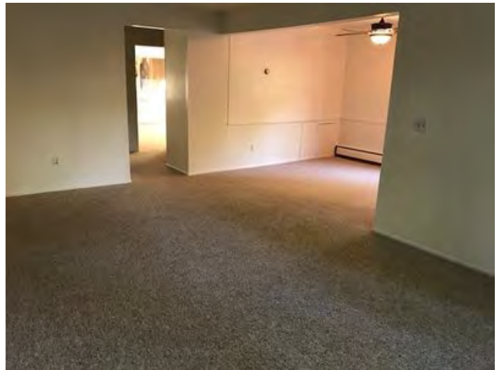
Apt 207 #3 - interior 8