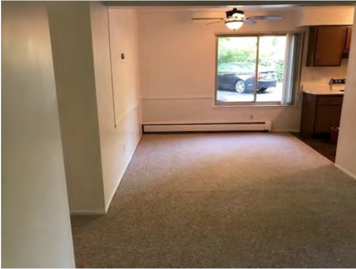
Apt 207 #3 - interior 10