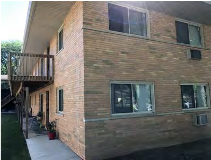
207 S Harris - interior apartments 2