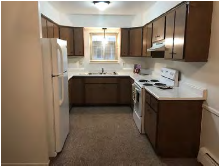
Apt 203 #4 (8)