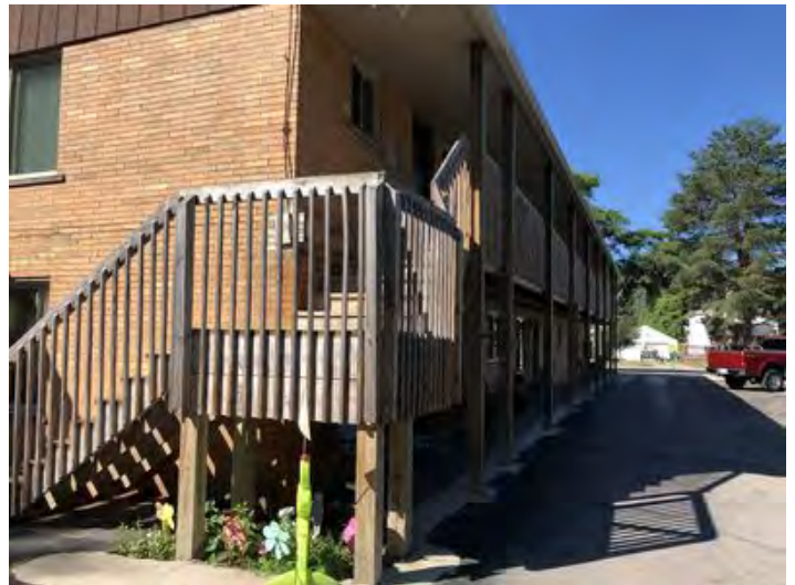
203 S Harris - exterior apartments 2