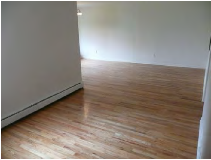
Apt 207 #8 (8)