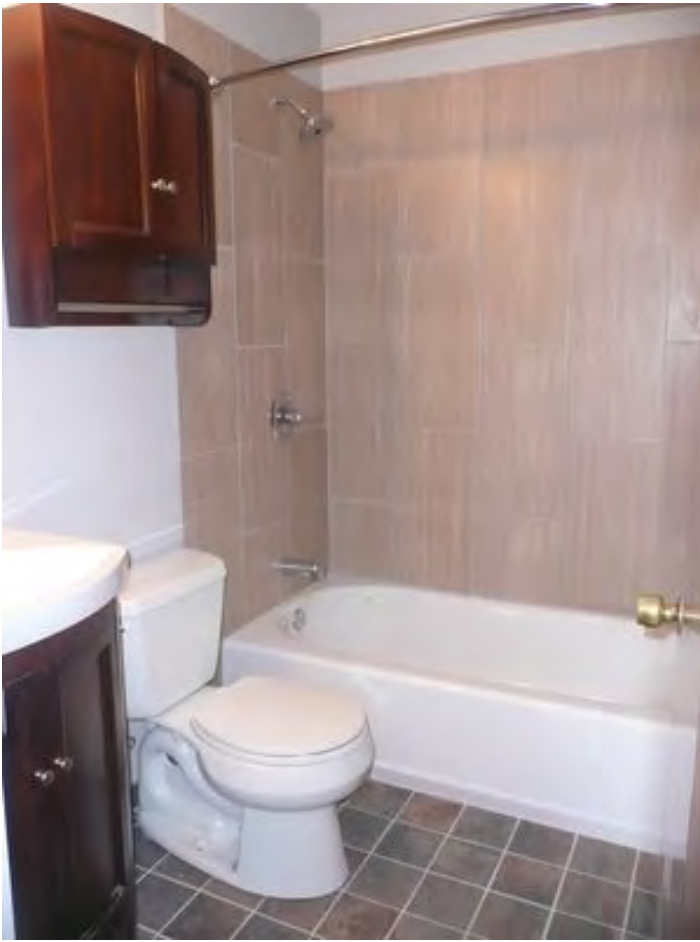
Apt 203 #6 (5)