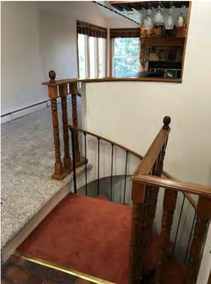
Apt 207 #8 (17)