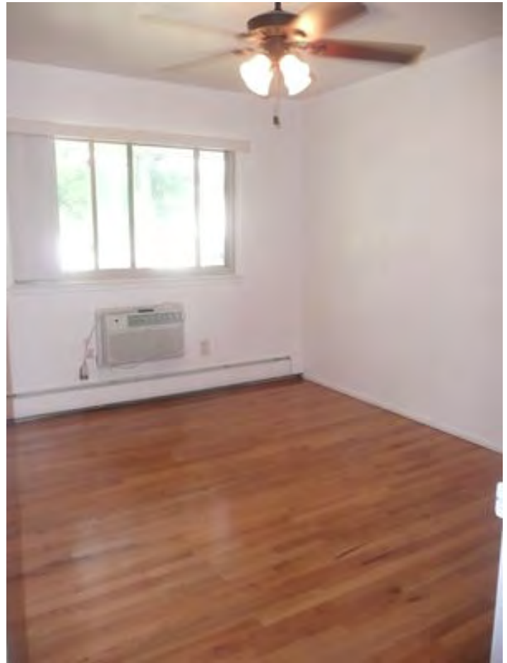
Apt 203 #10 (11)