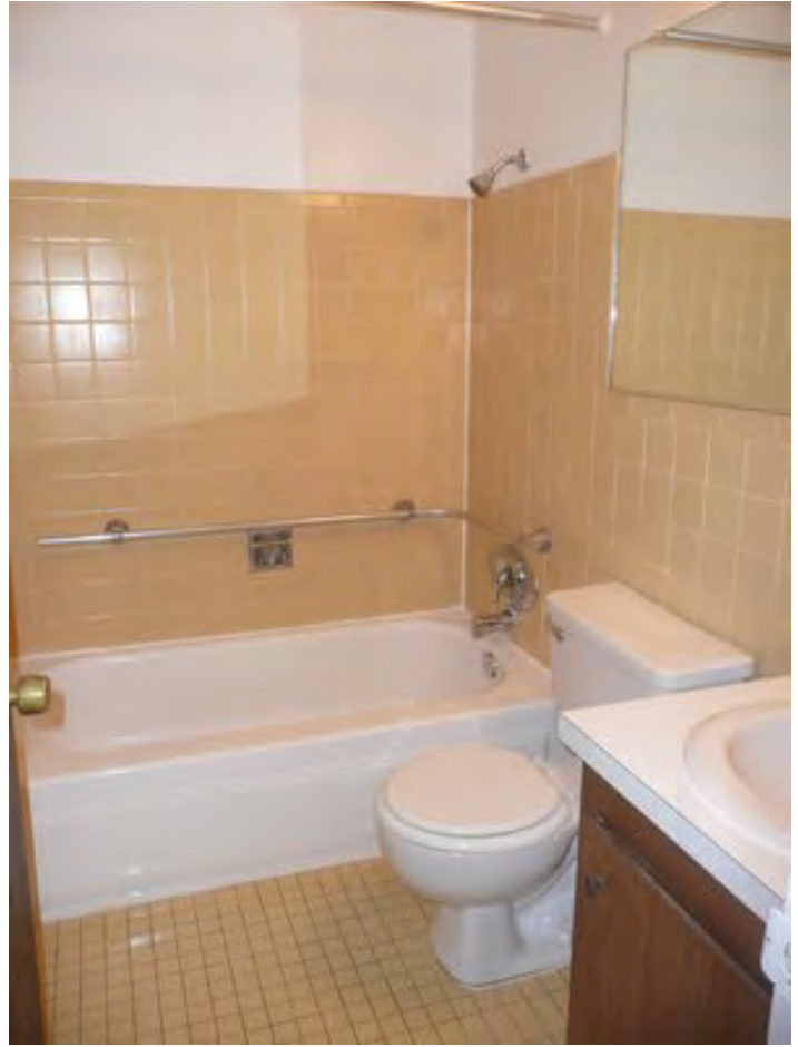
Apt 207 #6 (6)