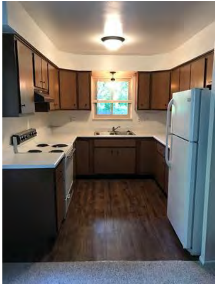
Apt 207 #3 - interior 6