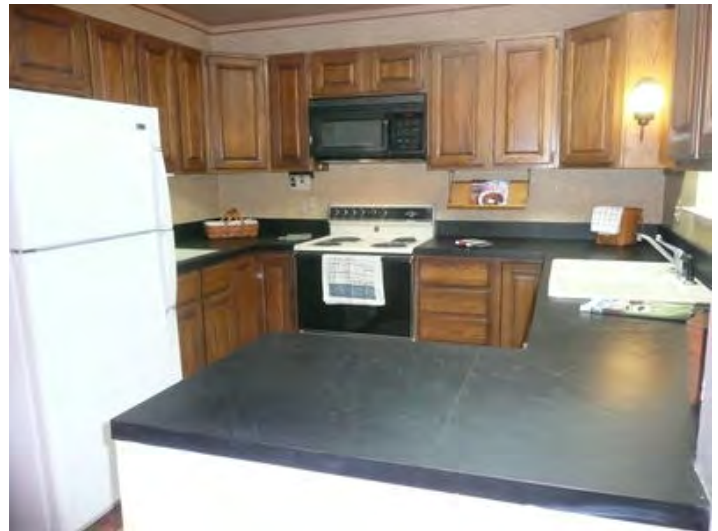
Apt 207 #8 (5)