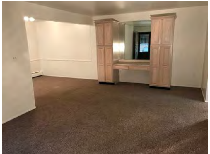
Apt 203 #4 (1)