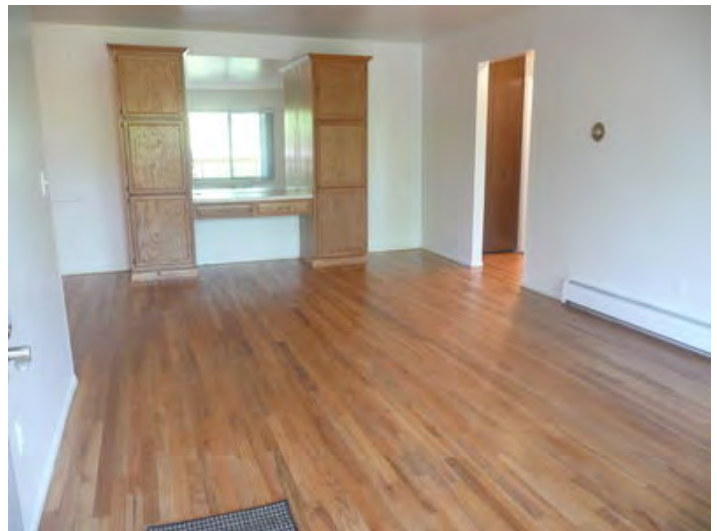
Apt 207 #7 (14)