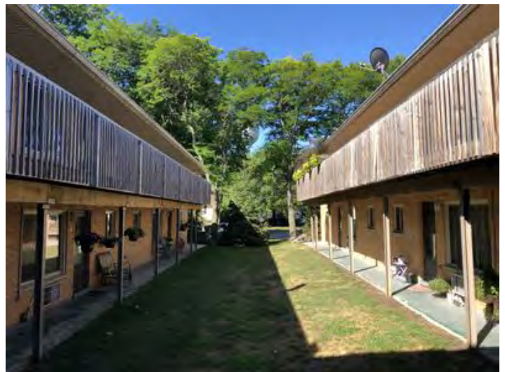
203-207 S Harris - courtyard 1