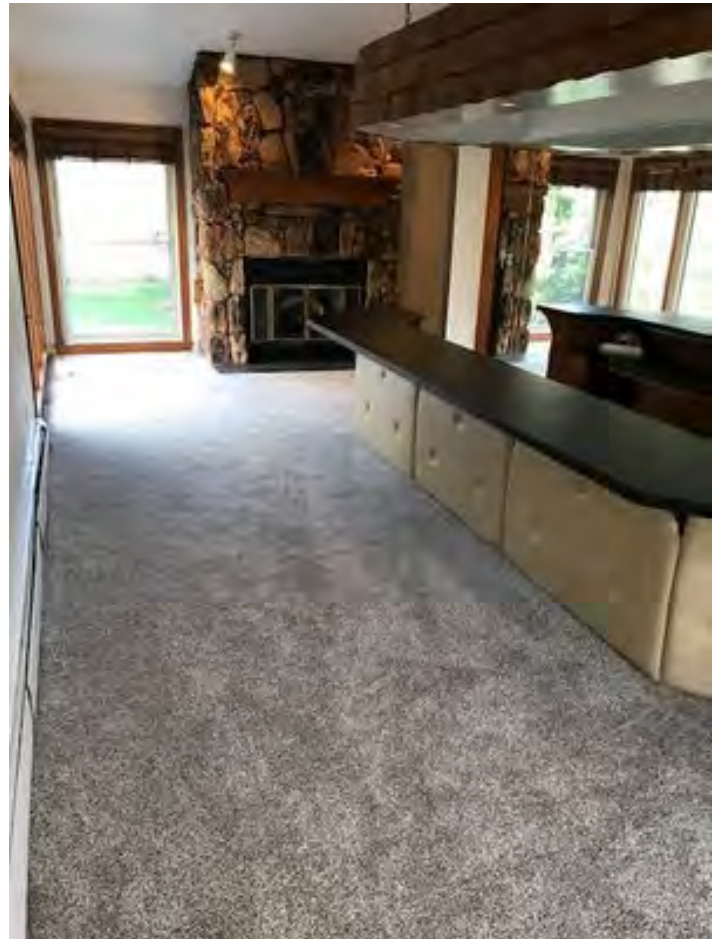
Apt 207 #8 (14)