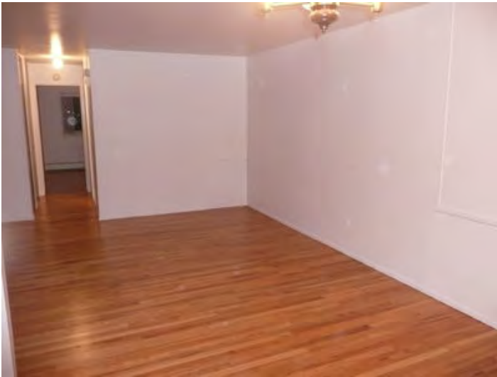
Apt 207 #6 (1)