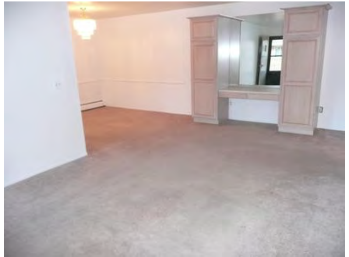
Apt 203 #9 (3)