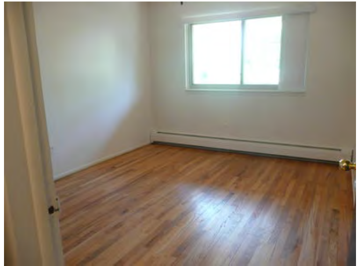
Apt 207 #7 (10)