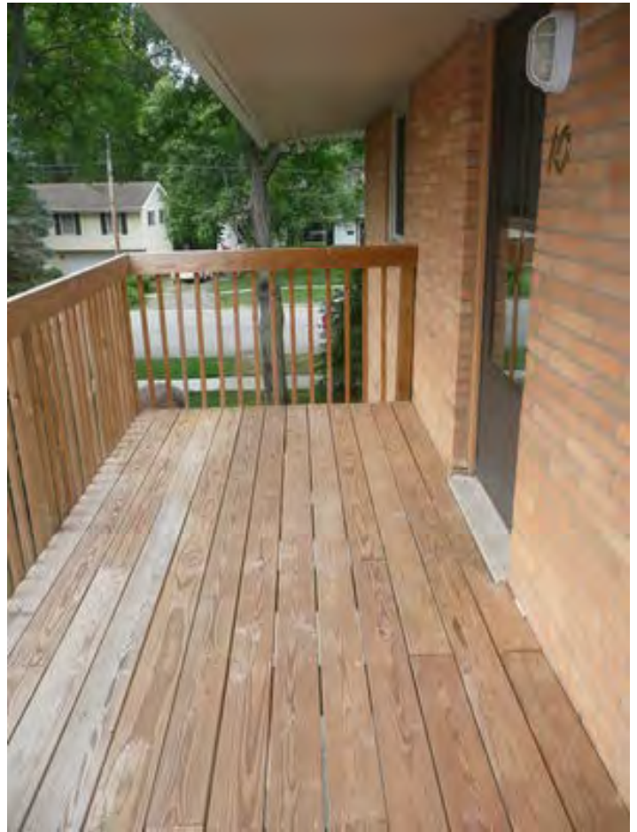
Apt 203 #10 (4)