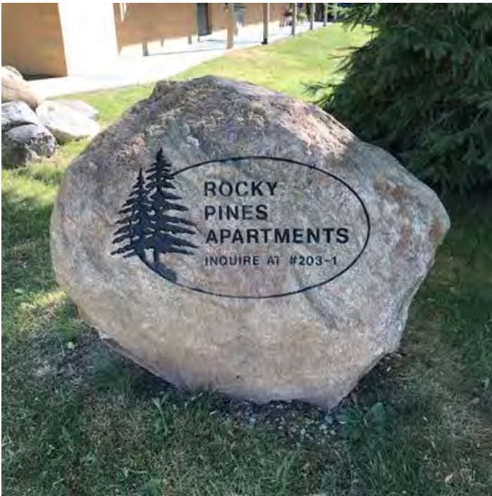
203 S Harris - Rocky Pines Apartments 2