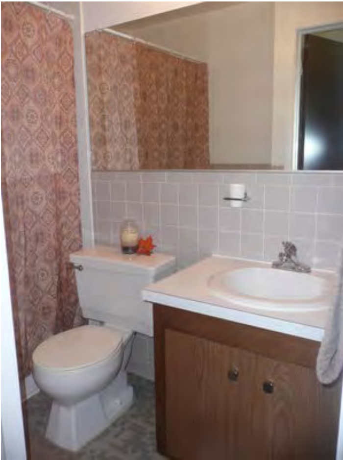
Apt 203 #10 (5)