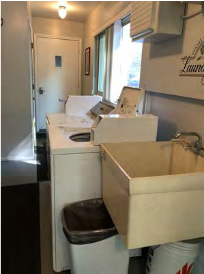
207 S Harris - laundry room