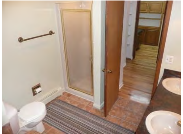
Apt 207 #8 (10)