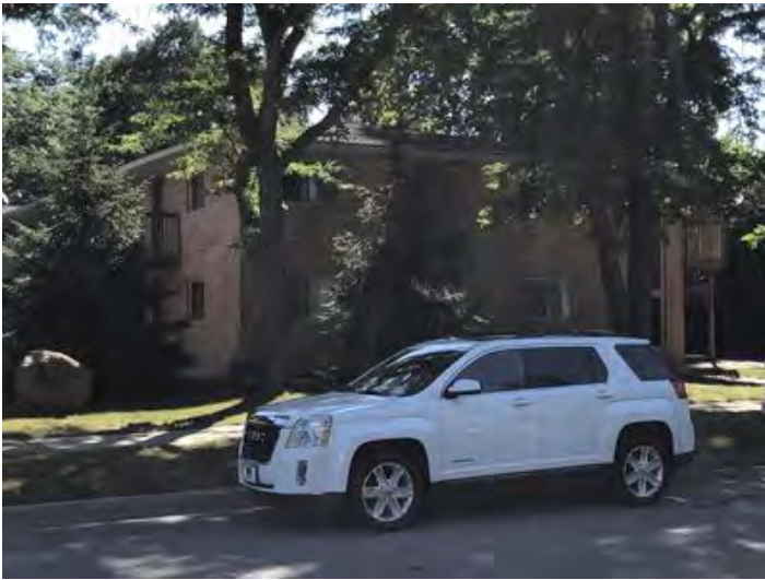
207 S Harris - exterior 1