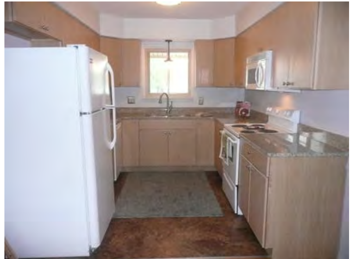
Apt 203 #6 (10)