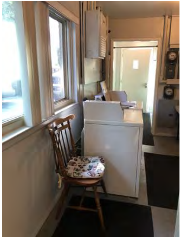
207 S Harris - laundry room 2