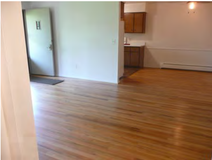
Apt 207 #7 (5)