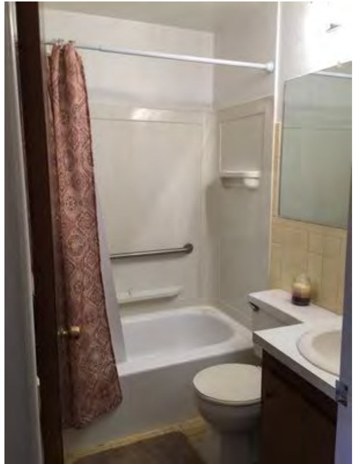
Apt 203 #7 (5)