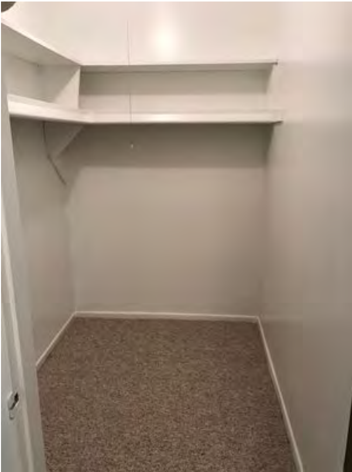
Apt 207 #3 - interior 1