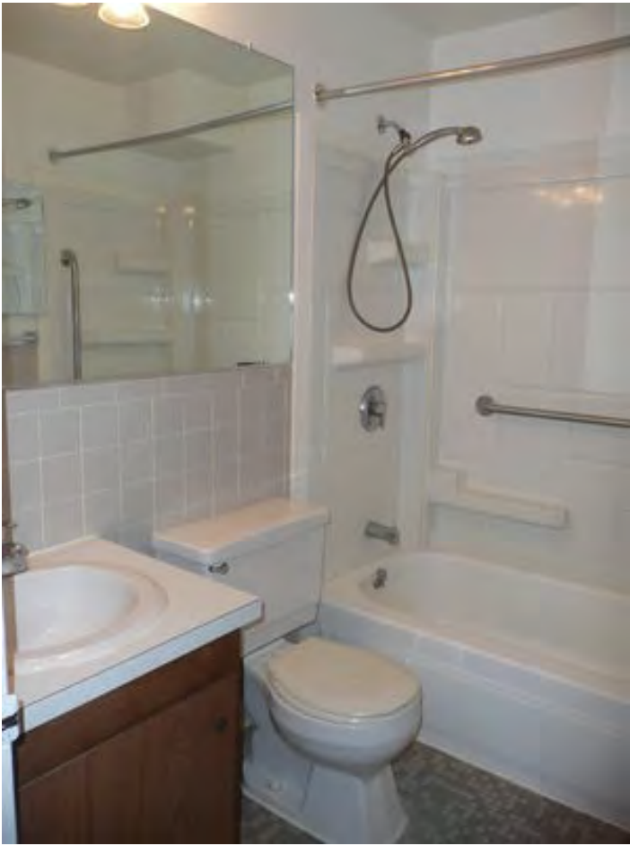
Apt 203 #8 (3)