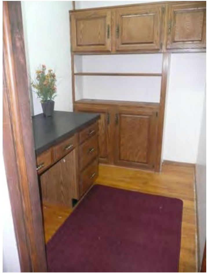
Apt 207 #8 (4)