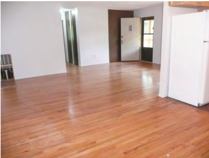
Apt 203 #6 (8)