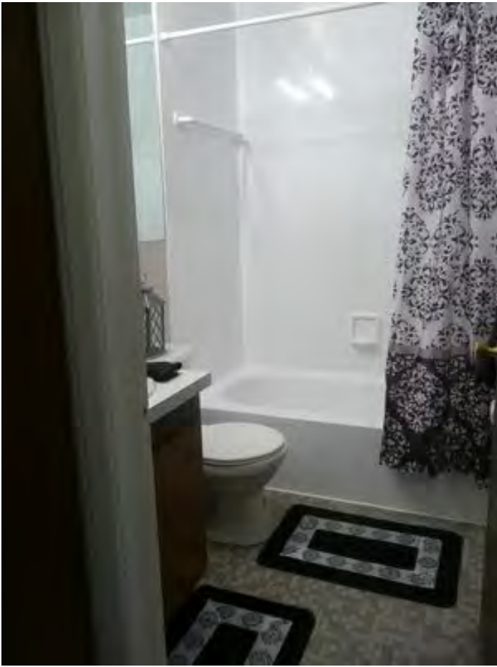
Apt 207 #7 (3)