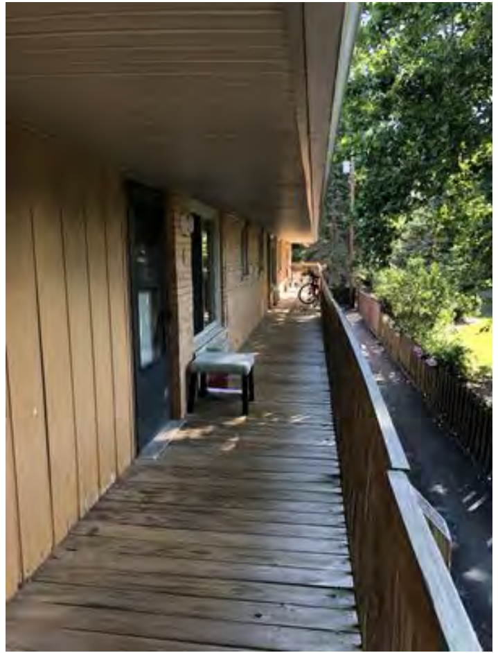
207 S Harris - upper balcony