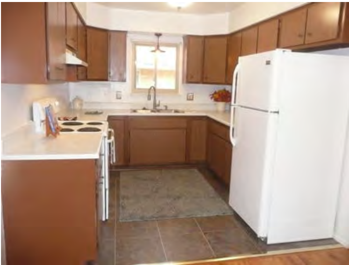
Apt 203 #10 (7)