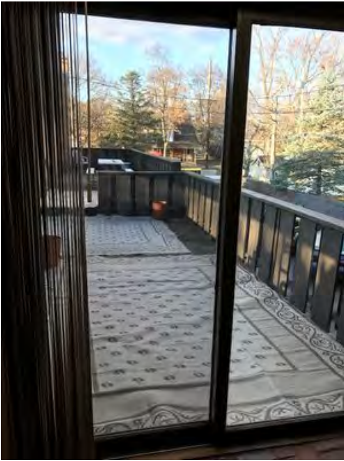
Apt 207 #8 (1)