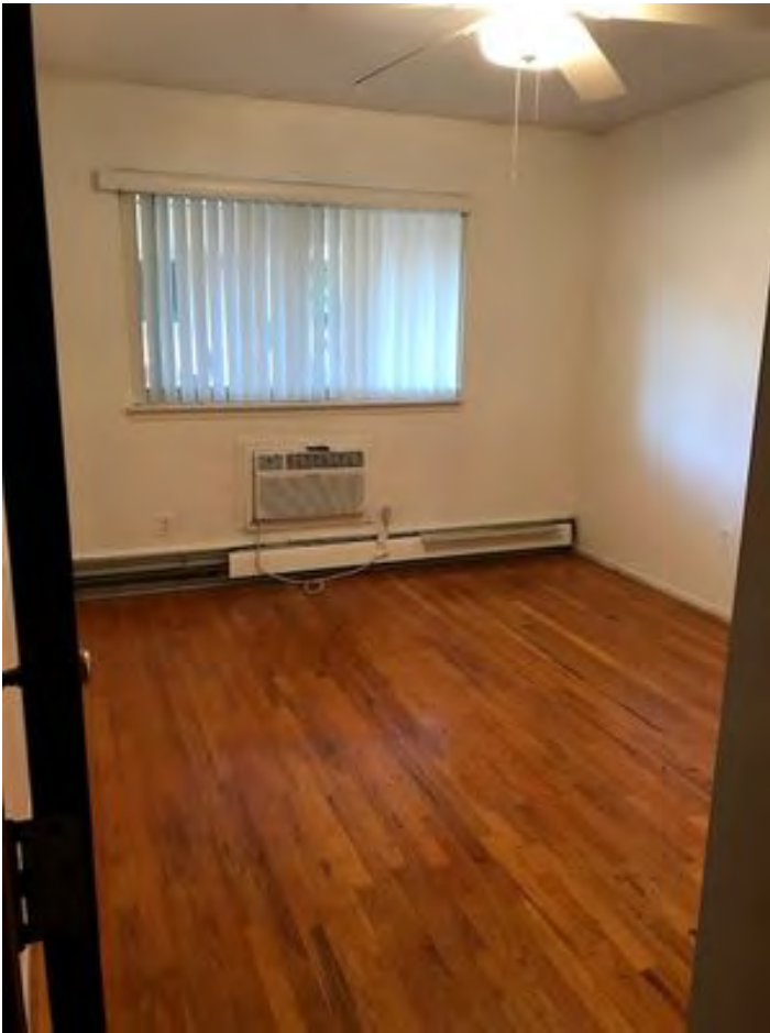
Apt 207 #8 (12)