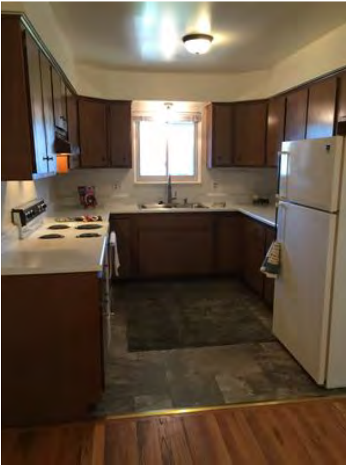
Apt 203 #7 (8)