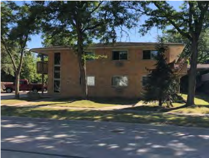
203 S Harris - exterior 2