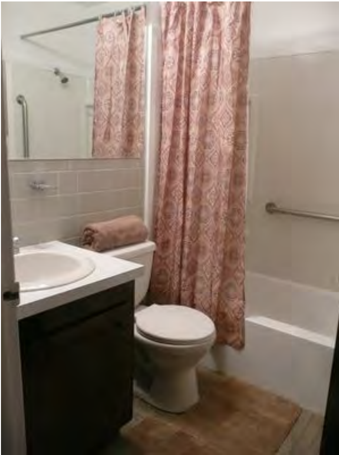
Apt 203 #9 (5)