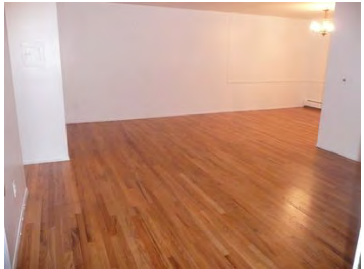
Apt 207 #6 (7)