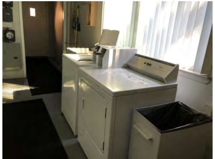
203 S Harris - laundry room 1