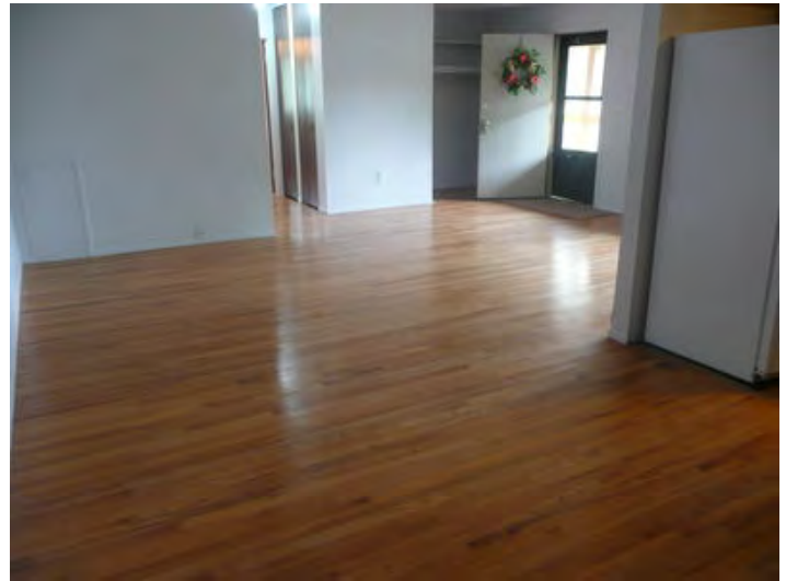
Apt 203 #6 (21)