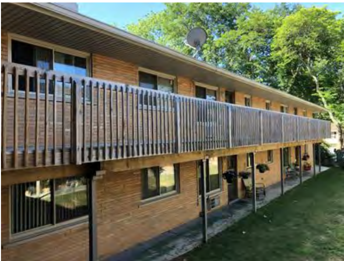
207 S Harris - interior balcony