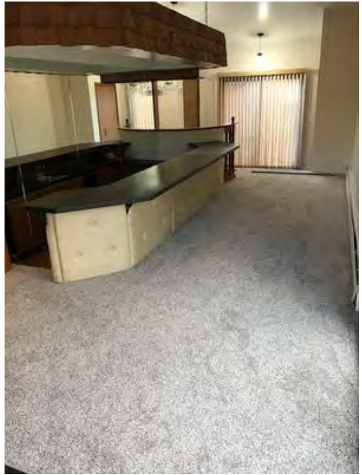
Apt 207 #8 (16)