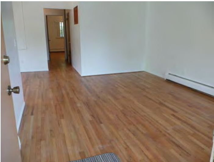
Apt 203 #8 (7)