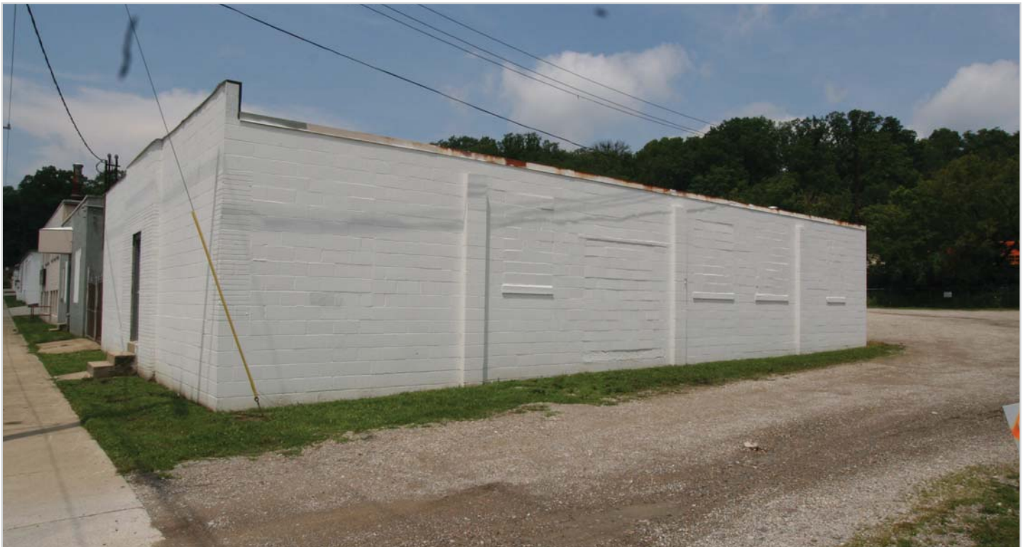
2,400 SF FREESTANDING BUILDING WITH DRIVE-IN DOOR