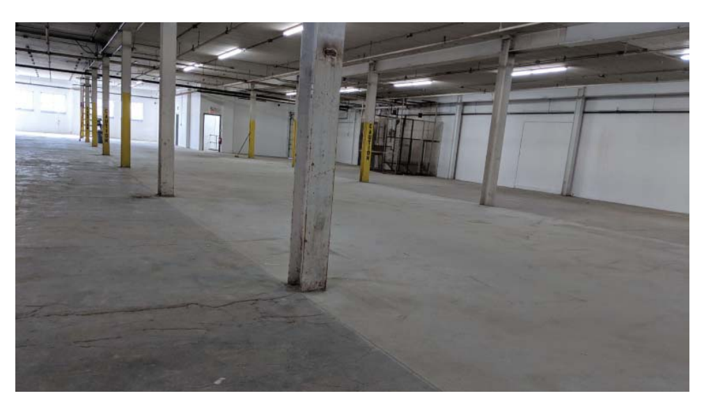
10,200 SF DOCKS DRIVE-IN