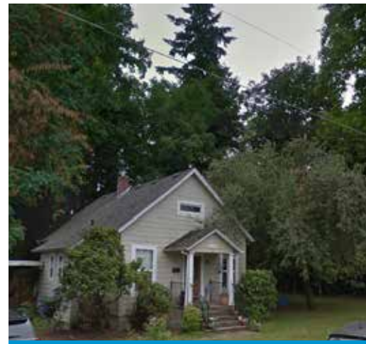
North side view - 8th Ave.