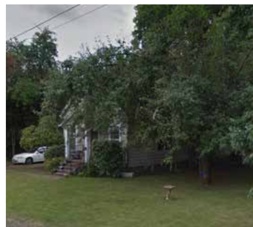
North side view - 8th Ave.