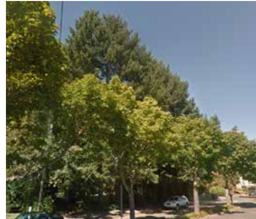
South side view - Willamette Falls Dr.