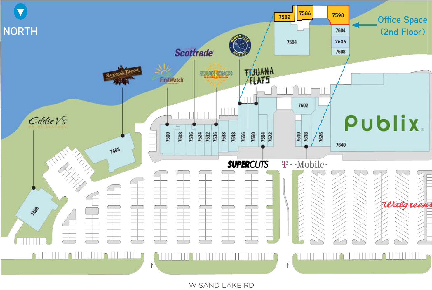
East Site Plan