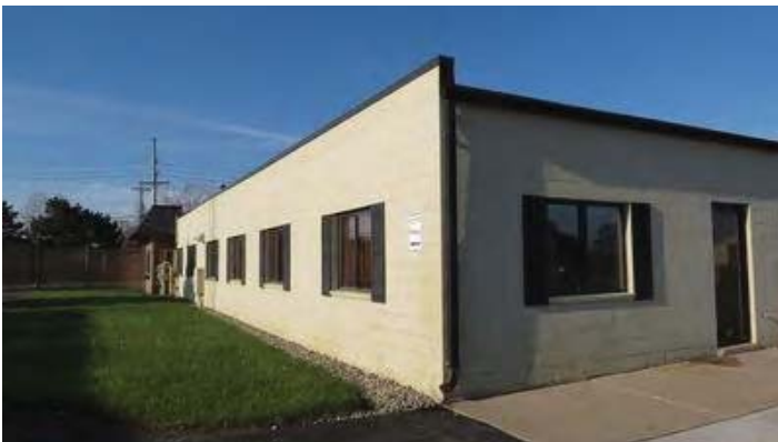
Building #1: Office Building with plenty of Windows