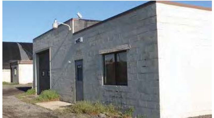
Building #4: Training