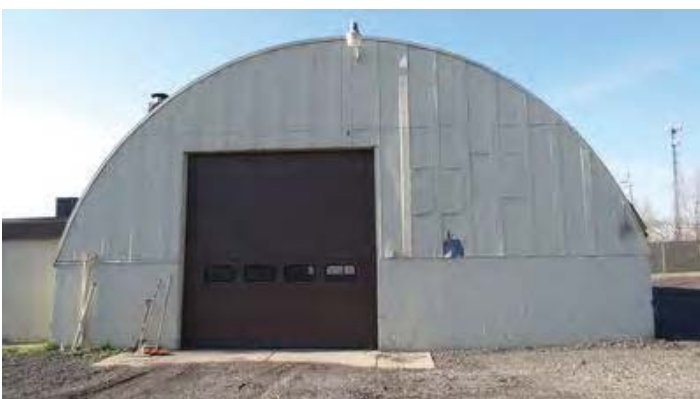
Building #3: Quonset