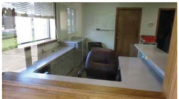
Building #1: Office Reception