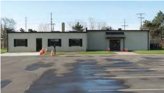
Building #1: Contractor and Executive Offices