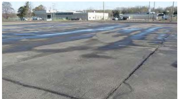
Plenty of Paved Parking