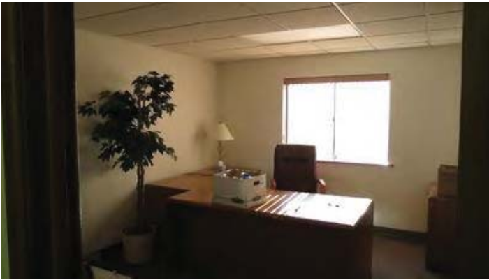
Building #1: Office