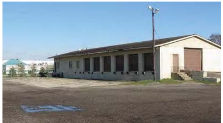
Building #6: Cross Dock