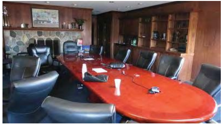
Building #1: Conference Room View 1