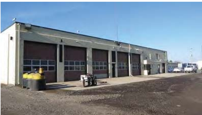
Building #2: Repair Garage