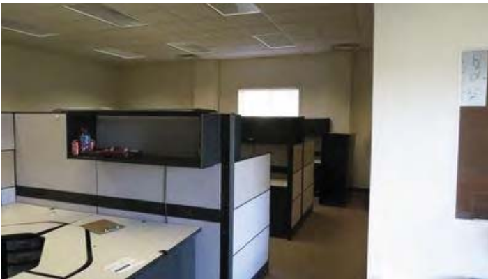
Building #1: Office Open Area