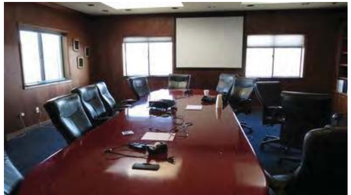
Building #1: Conference Room View 2