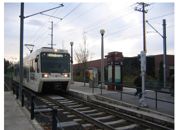
Next to Hawthorn Farm MAX Station