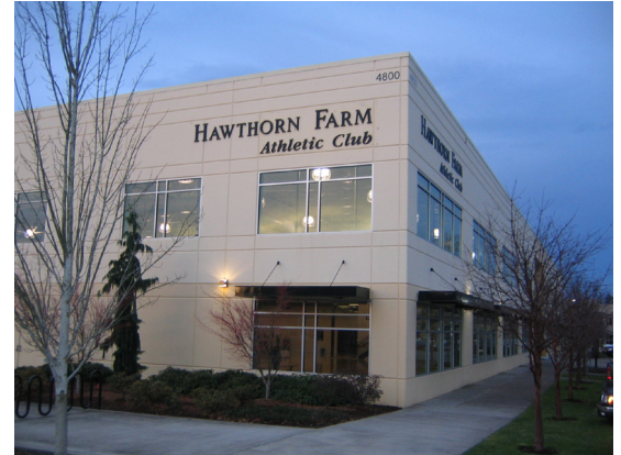
Across from Hawthorn Farm Athletic Club