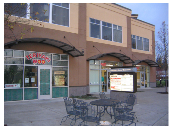
Close to restaurants and services