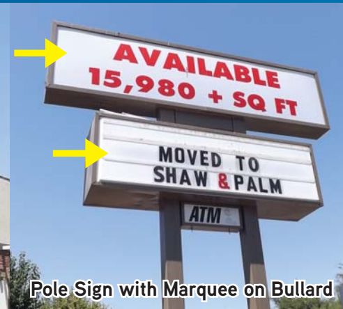
Pole Sign with Marquee on Bullard