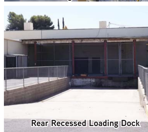
Rear Recessed Loading Dock

AGENT: GERALD CROSS 559 221 1271 | EXT. 103 FRESNO, CA gerald.cross@colliers.com BRE #00992292