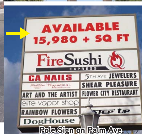
Pole Sign on Palm Ave