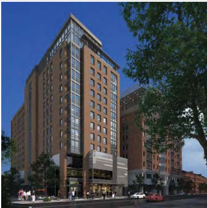
Six11 Exterior01-03.08.2017 reduced