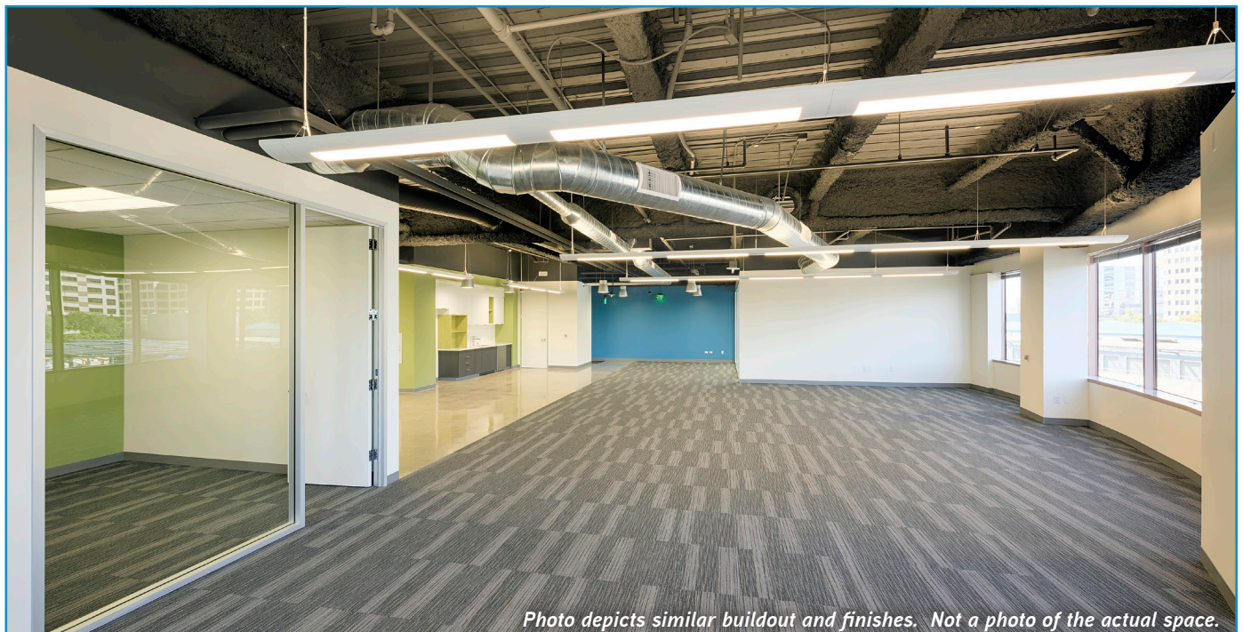
Photo depicts similar buildout and finishes. Not a photo of the actual space.

NICK POLSKY Vice President +1 510 433 5813 nick.polsky@colliers.com CA License No. 01472715