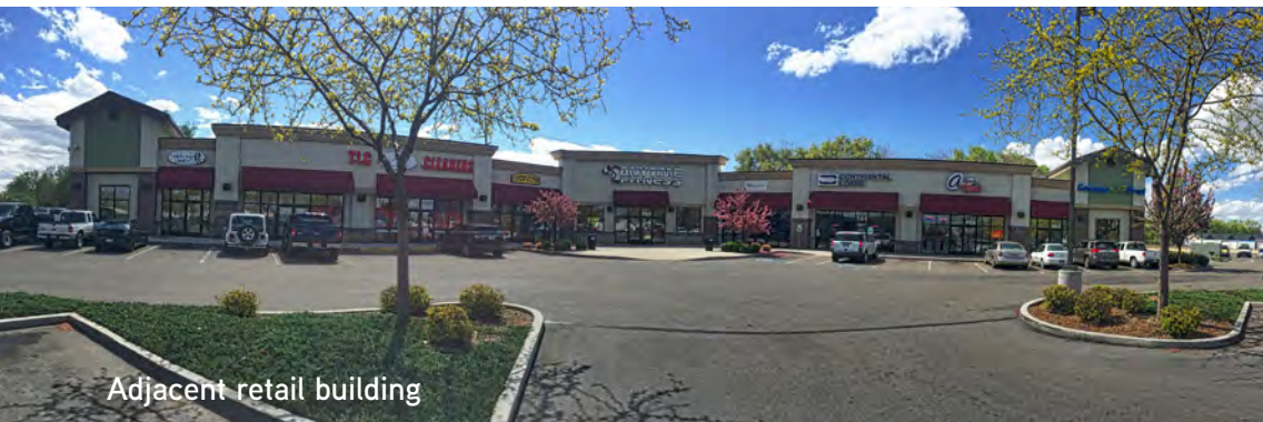
Adjacent retail building