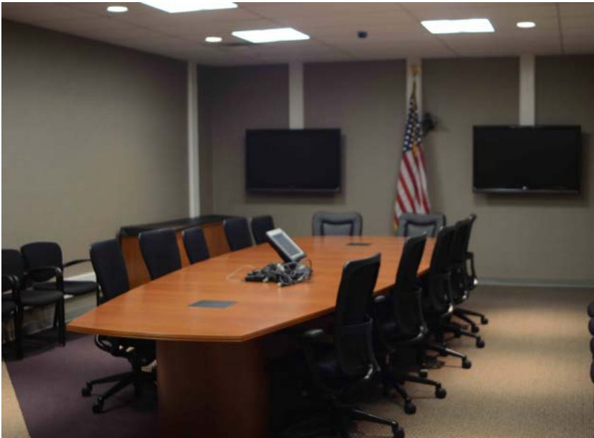
Secure conference room