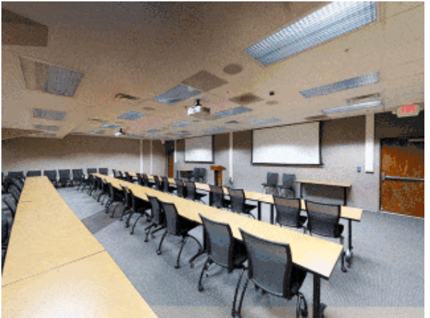
Classroom style configurable conference facility