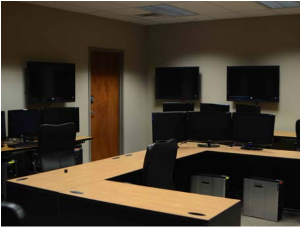
Highly secured command hub