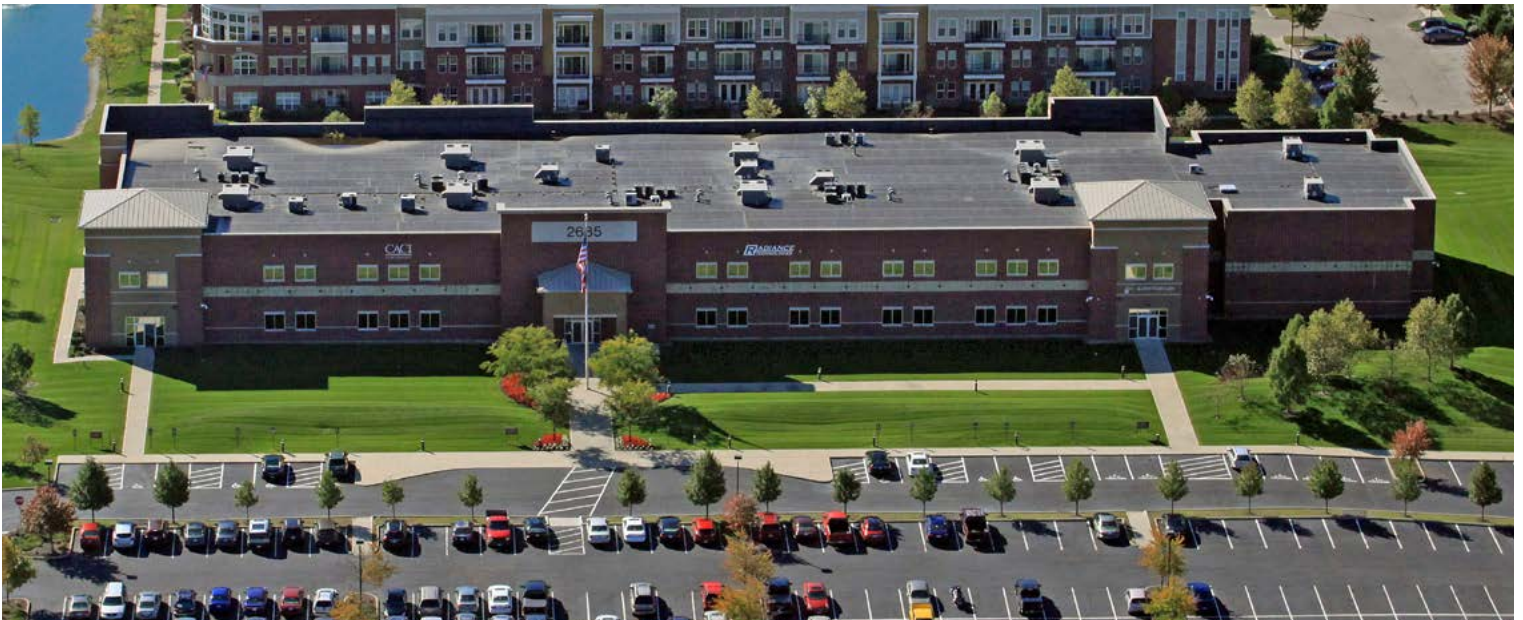
First floor highly secured SCIF