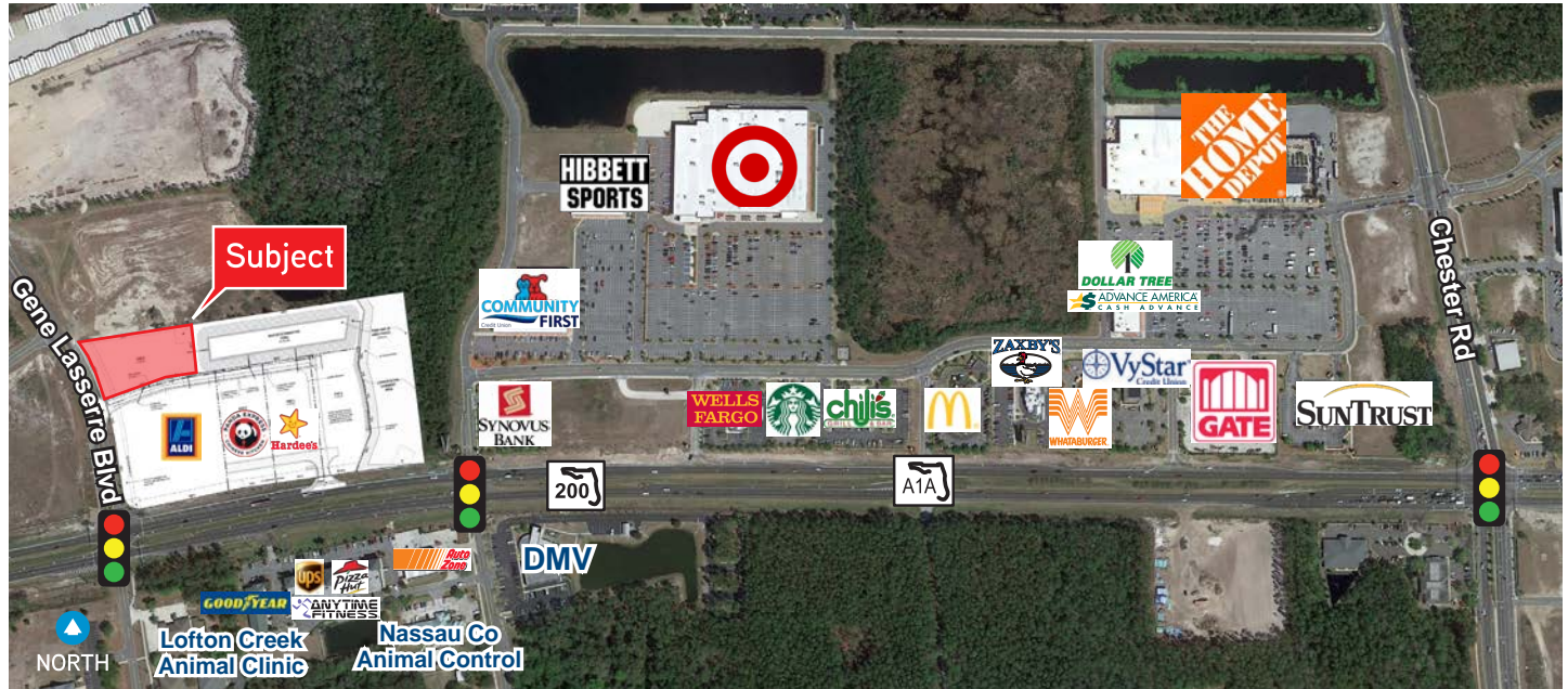
Aerial Map with Site Plan

SR 200 AND GENE LASSERRE BLVD., YULEE, FL 32097