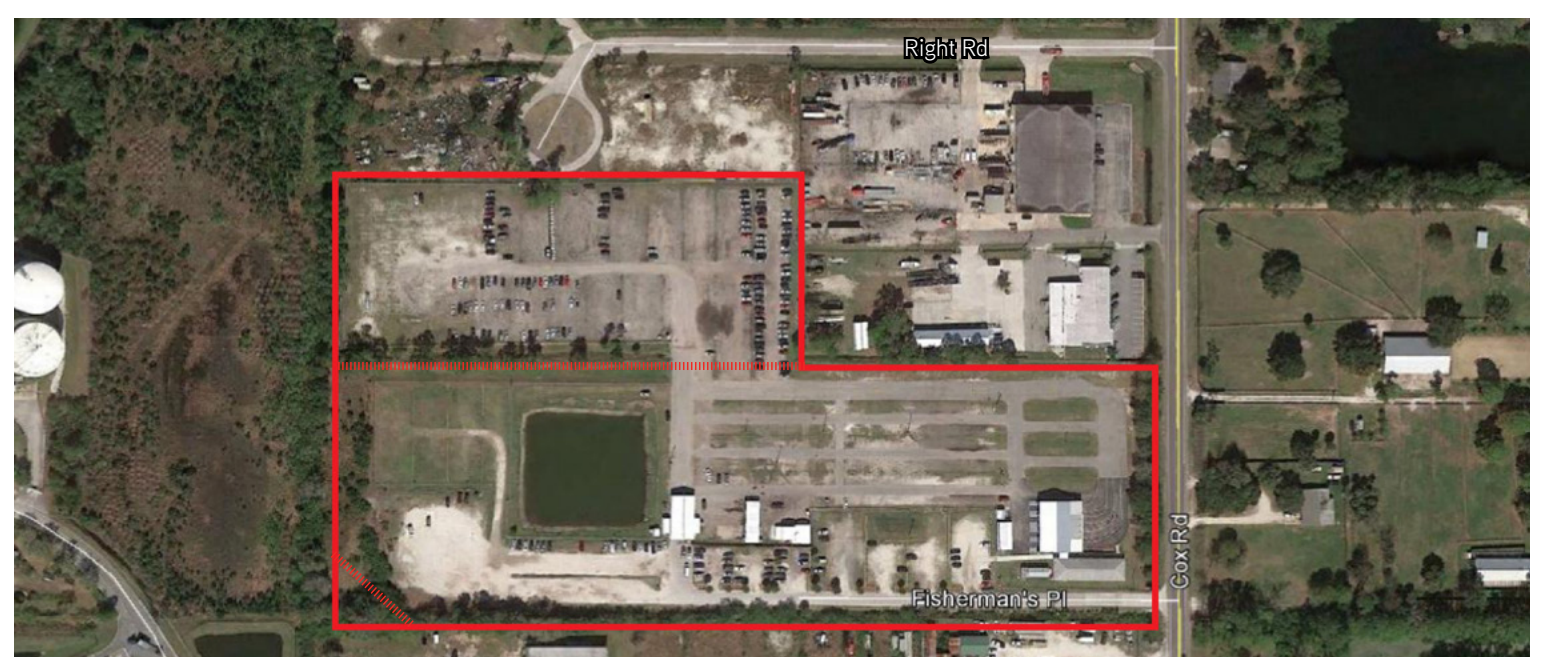
Click parcels to view property info on Property Appraiser website.