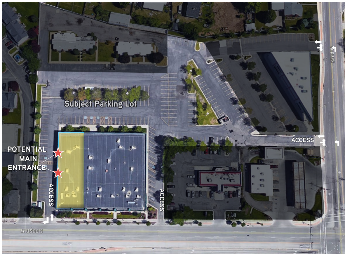
SINGLE TENANT / CONCEPTUAL SPACE PLAN