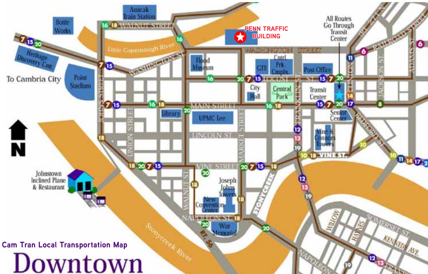
Cam Tran Local Transportation Map