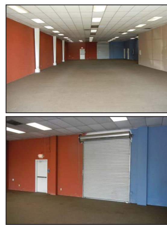
Rear Roll-Up and Standard Doors