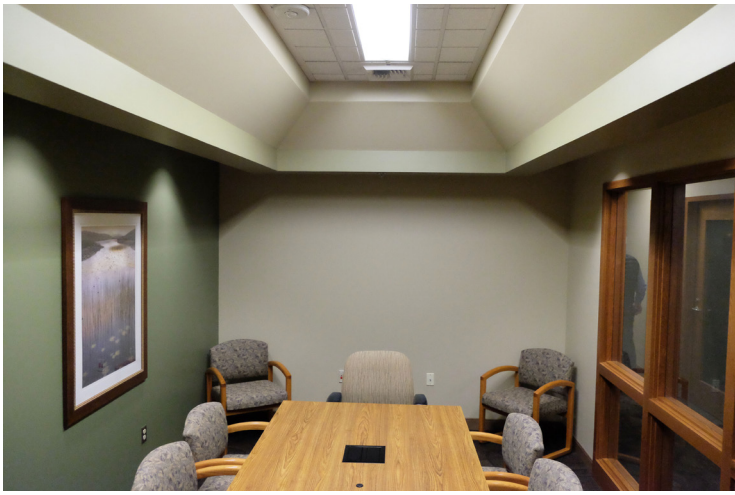
Suite 100 - 5,300 RSF