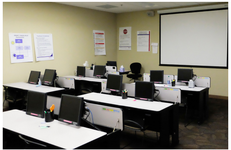
Suite 200 - 5,235 RSF