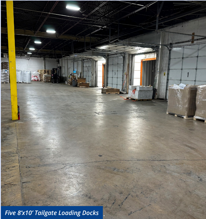
Five 8'x10' Tailgate Loading Docks