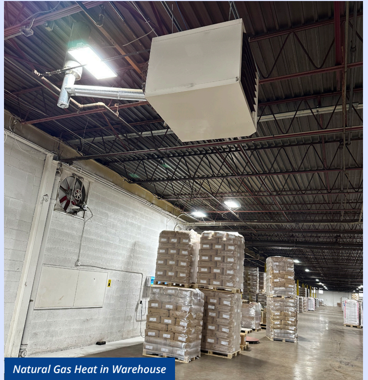
Natural Gas Heat in Warehouse