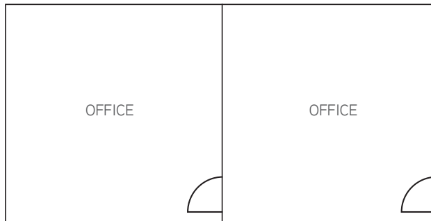
SUITE 877 #2 > Floor Plan > 432 RSF