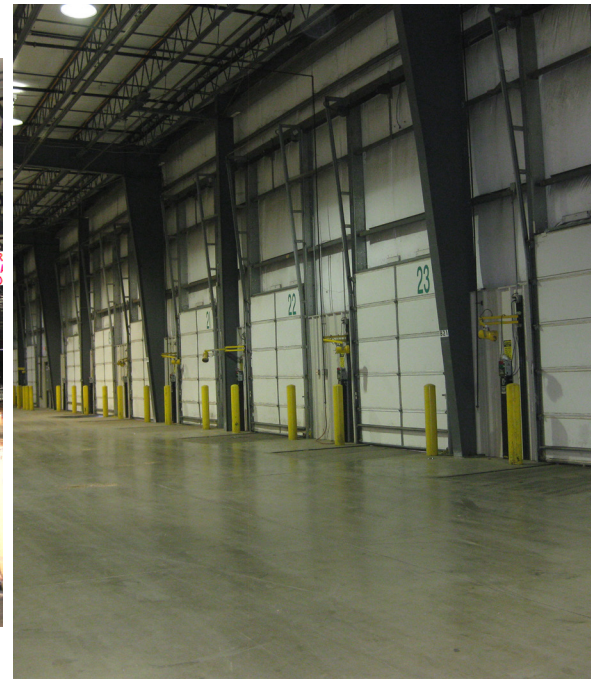
9' x 10' fully equipped docks with lights, levelers, locks