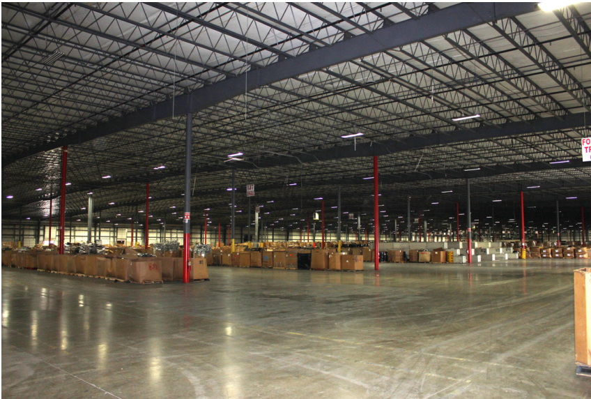
*Lighting recently upgraded to T-5 with motion sensors