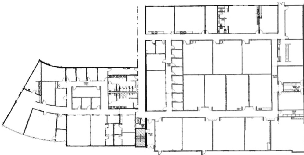
AS-BUILT FLOOR PLAN | 1st Floor