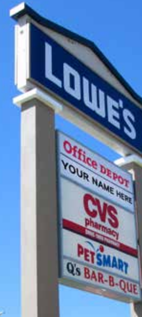
Conceptual New Storefront Rendering