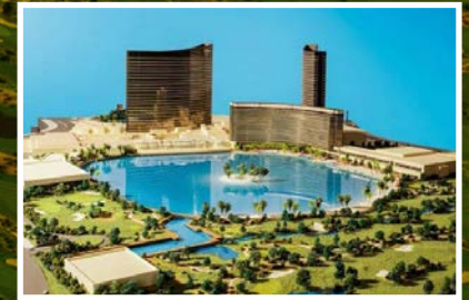
WYNN RESORTS PARADISE PARK WATERFRONT LAGOON $1.5 BILLION