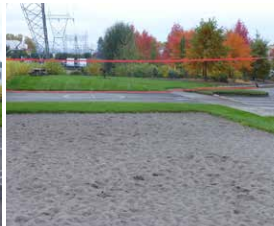
On-site recreation space for tenants

This document has been prepared by Colliers International for advertising and general information only. Colliers International makes no guarantees, representations or warranties of any kind, expressed or implied, regarding the information including, but not limited to, warranties of content, accuracy and reliability. Any interested party should undertake their own inquiries as to the accuracy of the information. Colliers International excludes unequivocally all inferred or implied terms, conditions and warranties arising out of this document and excludes all liability for loss and damages arising there from. This publication is the copyrighted property of Colliers International and/or its licensor(s). ©2019. All rights reserved. 11/6/14