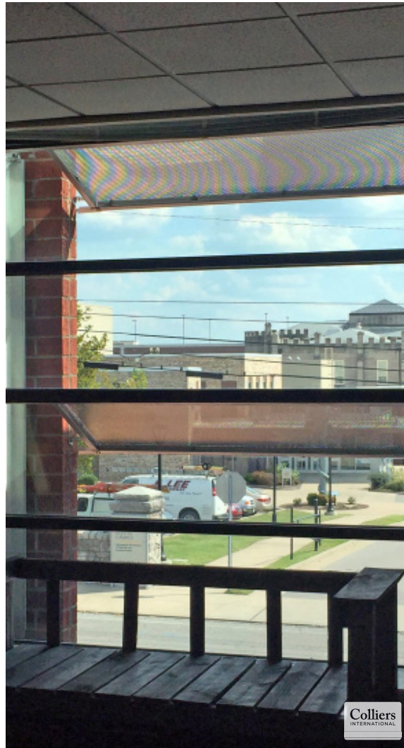
View Across Middleton Street - Nashville Children's