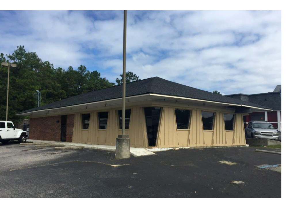
Exterior of free standing building facing Knox Abbott Road with excellent visibility and access.