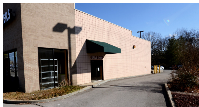
CLOCKWISE FROM TOP: Aerial view // Inside of Premises // Drive Thru // Birdseye view // Shopping Center