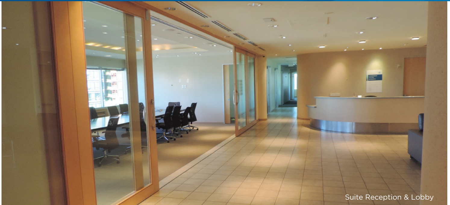
Suite Reception & Lobby