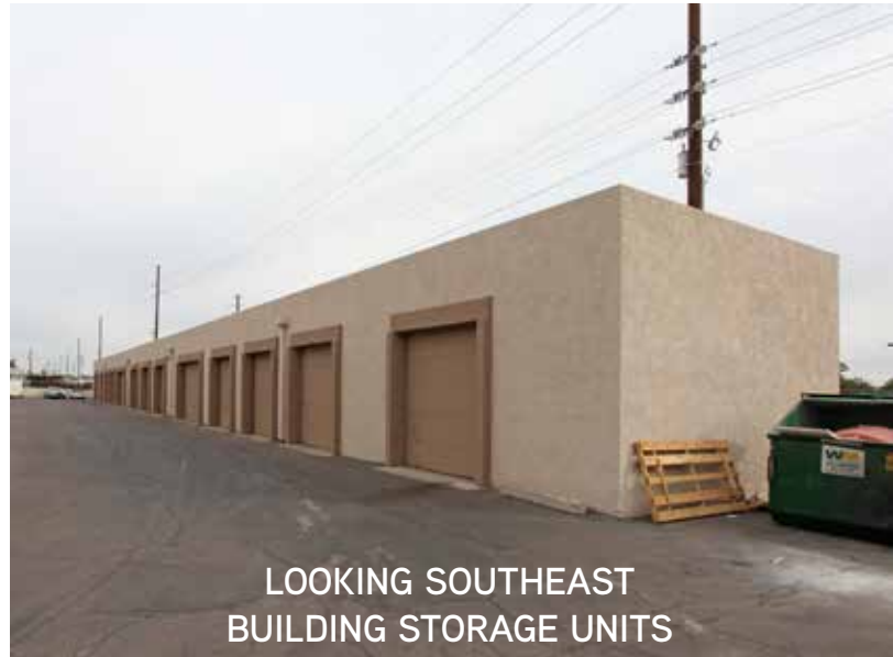
LOOKING SOUTHEAST BUILDING STORAGE UNITS