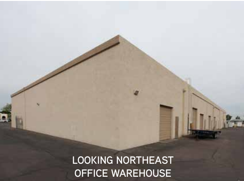
LOOKING NORTHEAST OFFICE WAREHOUSE