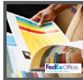
Business Services & Supplies