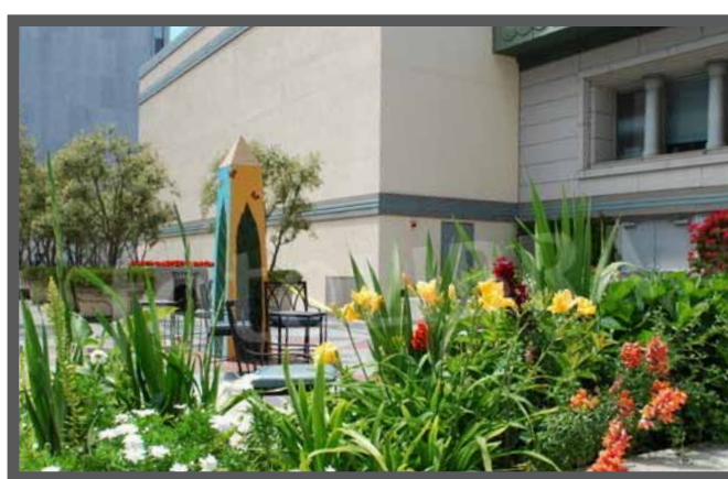
Building Amenity: Public Rooftop Garden