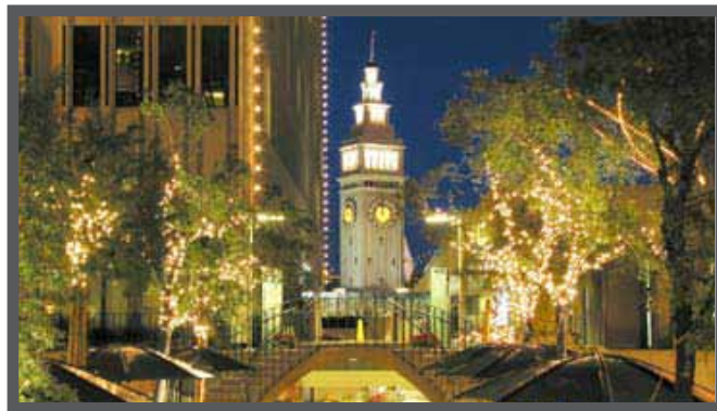
One block from Embarcadero Center - View of Ferry Building