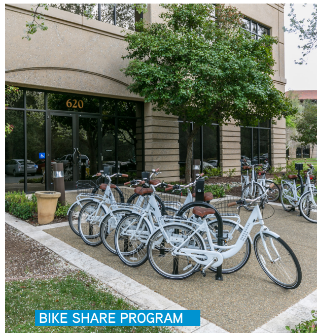
BIKE SHARE PROGRAM