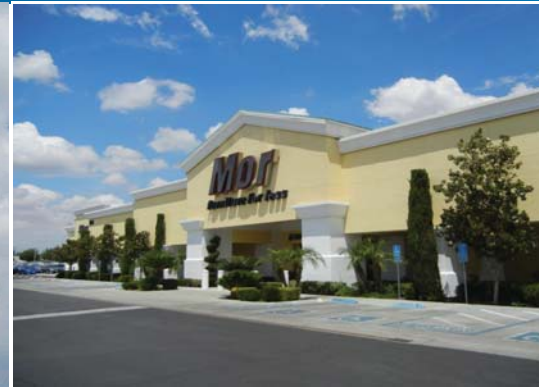
"Mor Furniture for Less" - Anchor