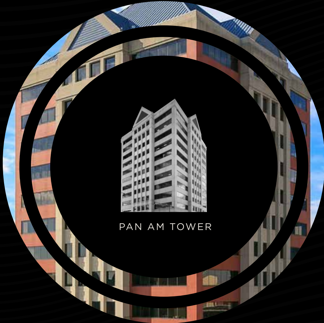
PAN AM TOWER