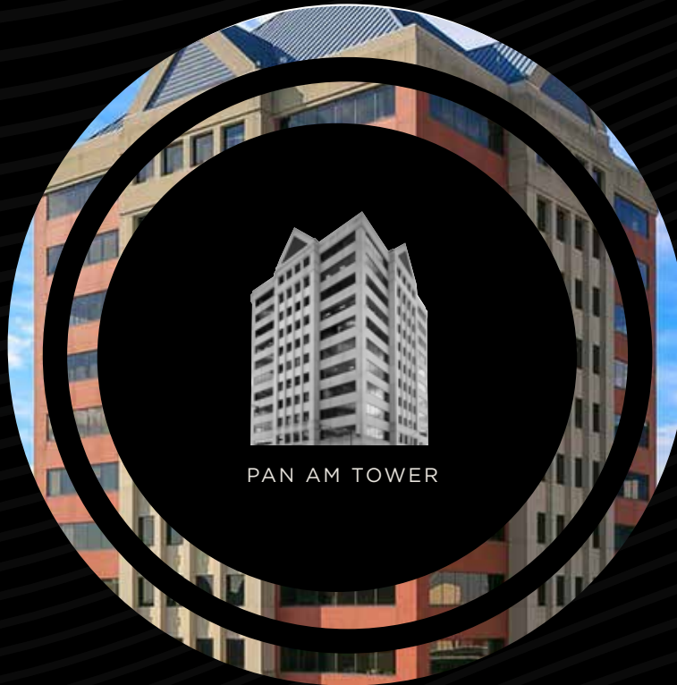
PAN AM TOWER