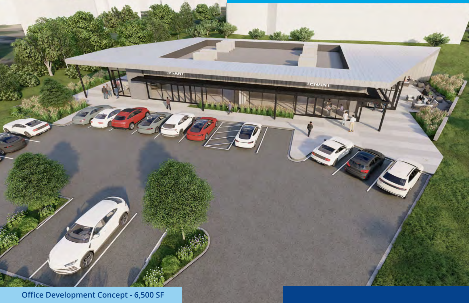
Office Development Concept - 6,500 SF