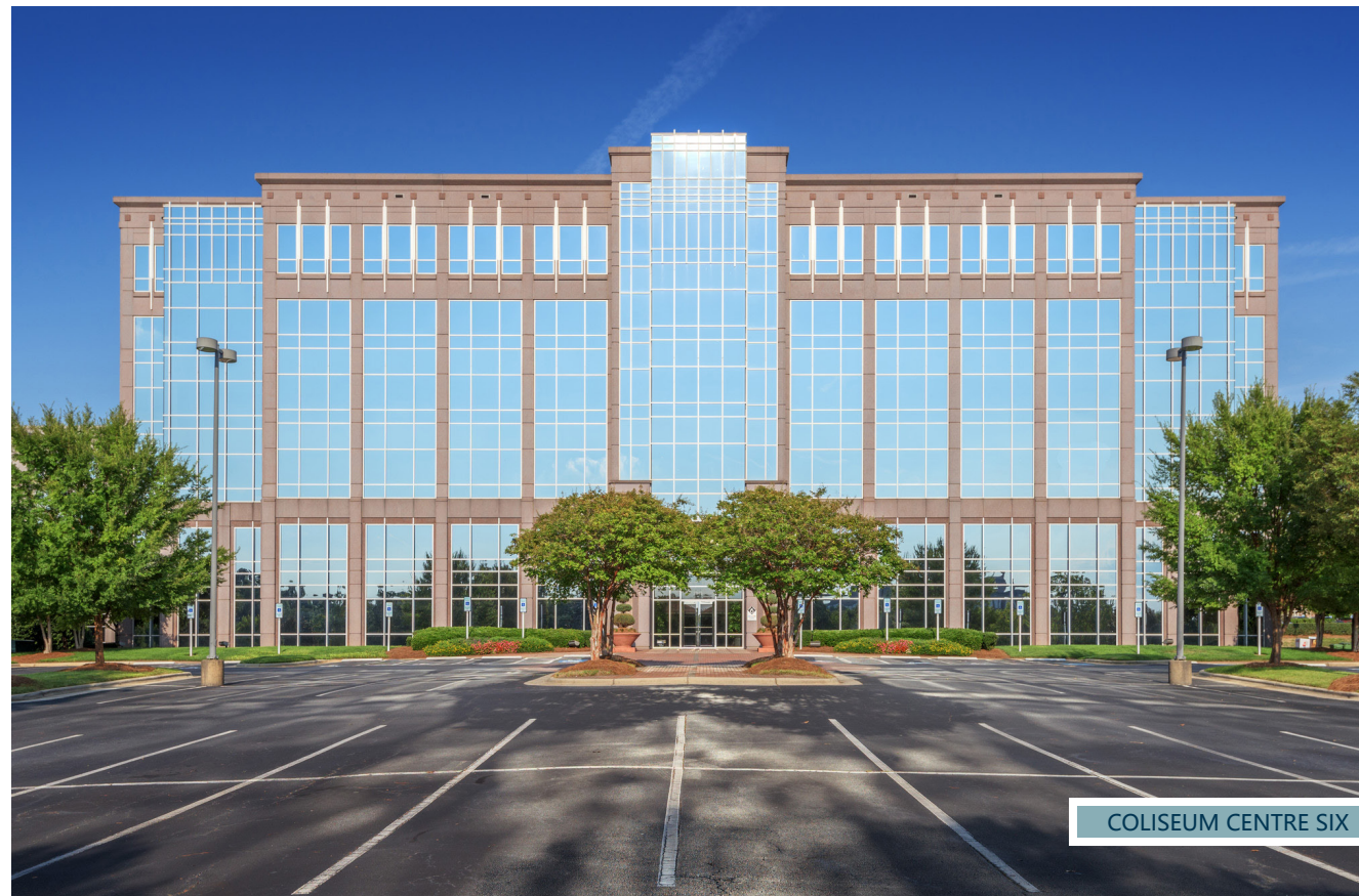
COLISEUM CENTRE SIX