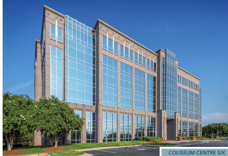
COLISEUM CENTRE SIX

Walking Distance to To Hotels, Restaurants & Retail