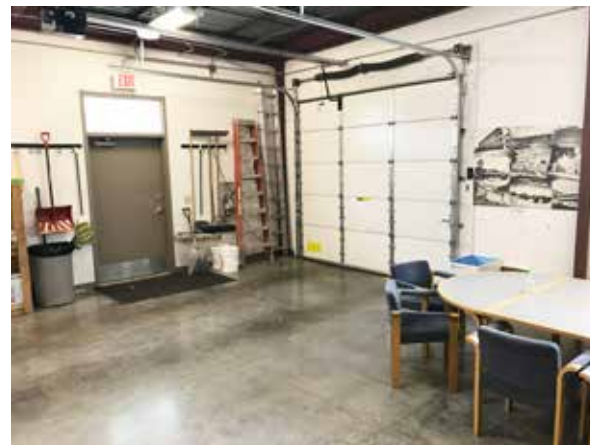
Small Warehouse / Storage Area